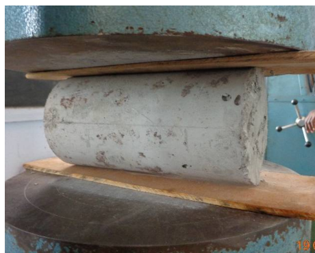
Fig 6: spilt tensile test