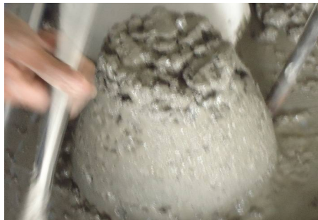
Fig 2 Slump testing