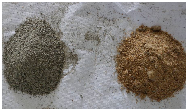
Fig.1 M-sand & River Sand

aggregate 1691kg/m 3 . Coarse aggregate 12 mm and 10 mm was used, which was manufactured from locally available rock.